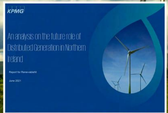
The new report by RNI/KPMG